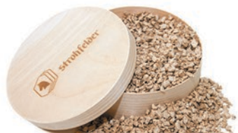
BRILLIANT innovative bedding from wood fibres

The highest quality and purity of Strohfelder® products is guaranteed by Austrian precise and continuous product development and deep knowledge of litter industry.