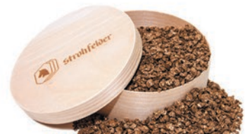
PLATINUM ORIGINAL innovative straw based bedding